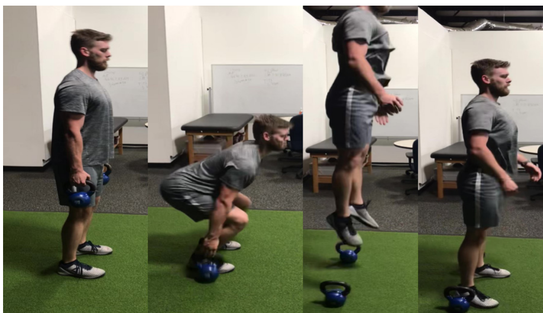
Figure 2. Example depiction of manually releasing additional eccentric loads to implement accentuated eccentric loading during jumping variations.

There are many ways to implement AEL, such as manual application of forces by another individual, elastic bands, computer-driven apparatuses, and weight releasing (manually released by the participant or a device) [8,89,90]. The manual application of forces may be useful but creates difficulty when prescribing quantifiable loads, as the amount of resistance provided may differ between individuals and between repetitions by the same individual. Computer-driven methods appear to be effective [82,91], but the cost of purchasing and implementing them are not viable for most practitioners. Other methods of implementing low magnitudes of submaximal AEL that are more quantifiable are elastic bands or dumbbells, which are held during the eccentric actions and released prior to initiating